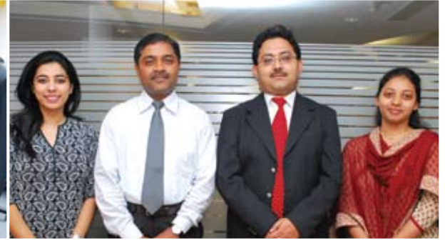
Travel & Bancassurance Team